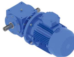
Hollow Input Solid Output