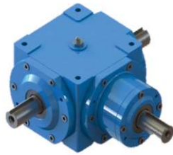
1 Input / 2 Output