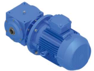
Hollow Input Hollow Output