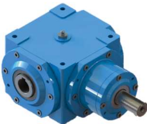
1 Solid Input / Hollow Output / Solid Output