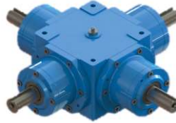
1 Input / 3 Output