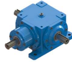
1 Input / 2 Output / 3 Output