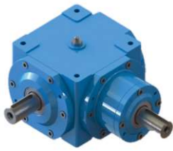
1 Input / 1 Output